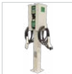
EVSE Inc. Standard