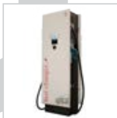
Efacec QC20 DCFC