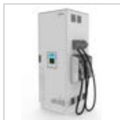
Efacec QC50 DCFC