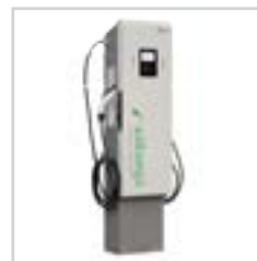
Efacec Level II