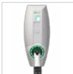
EV Box Pedestal