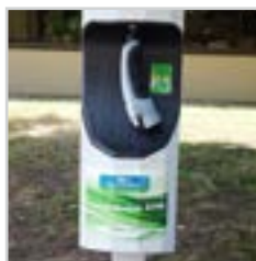
EVSE, Inc. Auto-Retract