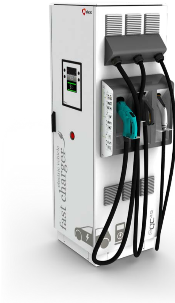
Sample Rendering of BTC Level 2 Charging Station , 7.2kW max output, w/ optional credit card reader