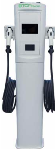
Single Port quoted, will only have 1 cord)