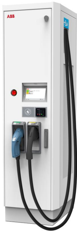
ABB Inc. 4050 E. Cotton Center Blvd Phoenix, AZ 85040 www.abb.com/evcharging

With thousands of DCFC units deployed in around 70 countries worldwide , ABB's Terra platform is the proven, reliable solution to address EV fast charging needs for drivers at retail centers, travel stops, convenience stores, urban parking, campuses, fleets and OEM development applications. ABB's 50 kW DC Fast Charger Terra 53 CJ UL combines industry standards with fast charging technology to support all current and next generation electric vehicles, meeting all, and latest versions of CCS and CHAdeMO.