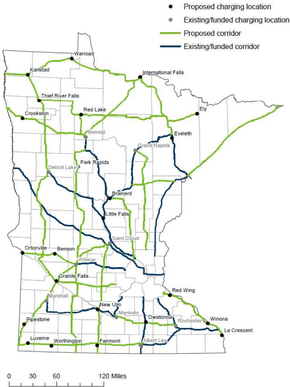
Figure 6: Proposed electric vehicles charging corridors for funding in Phase 2

The MPCA has identified preliminary roadways for funding. Some cities identified here are receiving a DC fast-charging station from Phase 1. Some locations have been chosen as preferred locations for a DC fast-charging station based on location. MPCA is not proposing to fund any DC fast-charging stations within the seven-county Twin Cities metro area due to the present publically available options for charging.