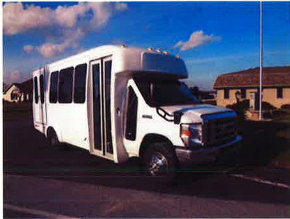
Picture is from a similar vehicle