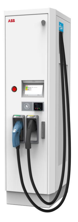
ABB I nc. 4050 E. Cotton Center Blvd Phoenix, AZ 85040 www.abb.com/evcharging

With thousands of DCFC units deployed in around 70 countries worldwide, ABB's Terra platform is the proven, reliable solution to address EV fast charging needs for drivers at retail centers, travel stops, convenience stores, urban parking, campuses, fleets and OEM development applications. ABB's 50 kW DC Fast Charger Terra 53 CJ UL combines industry standards with fast charging technology to support all current and next generation electric vehicles, meeting all, and latest versions of CCS and CHAdeMO.