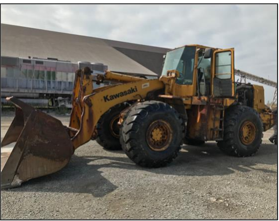
2011 Kawasaki 90 ZV-2 Wheel Loader

Frick Services' is requesting project funding to replace their 2011 Kawasaki 90 ZV-2 wheel loader with a new, 2019 Case 1021G wheel loader. The 2011 Kawasaki 90-ZV 2 wheel loader was identified for replacement by South Shore Clean Cities based on its high annual usage and fuel consumption rate. Based on Frick Services' equipment replacement schedule, the 2011 loader is planned to be replaced in 2024. As with many pieces of nonroad diesel equipment, this 2011 wheel loader will be fixed, welded, and maintained