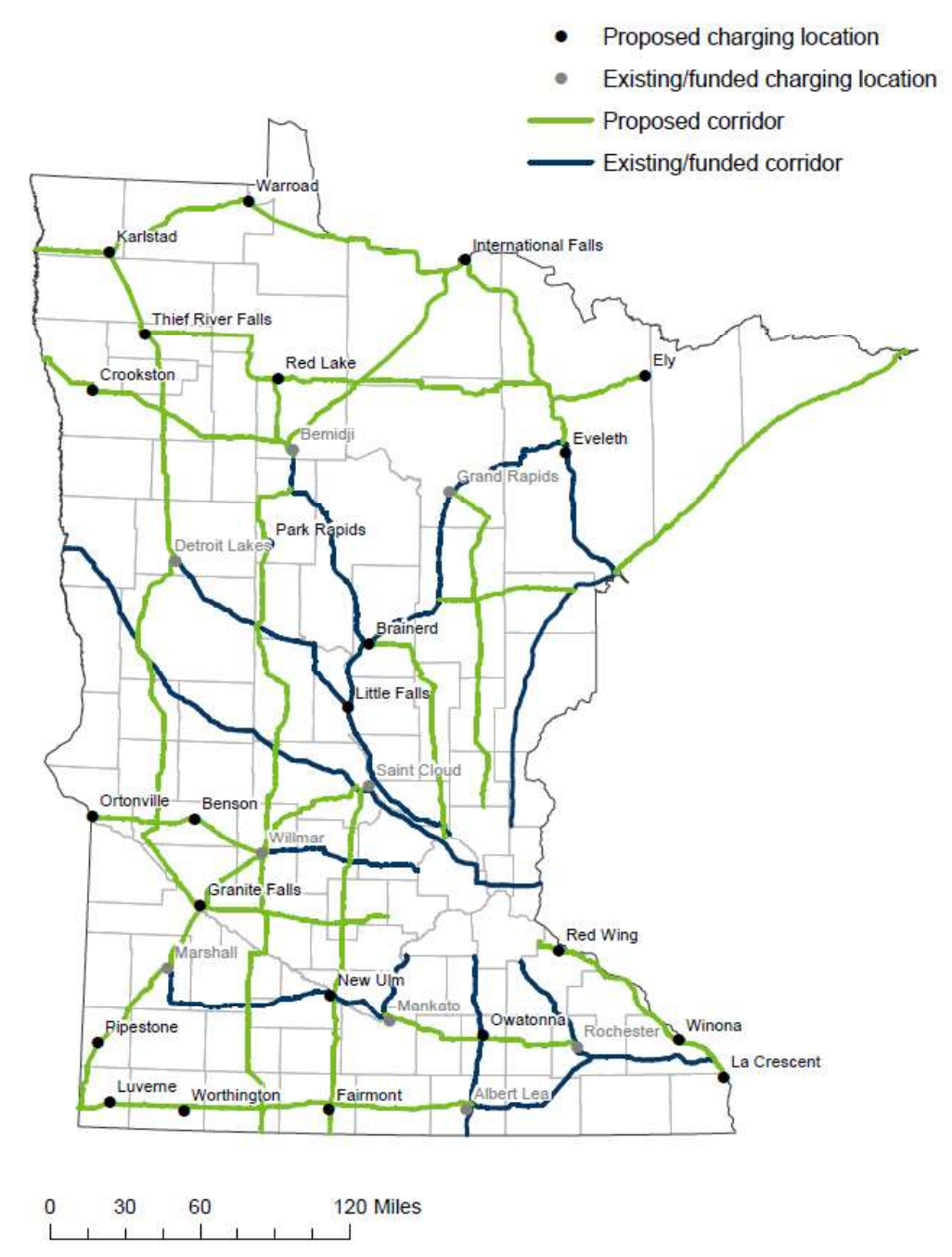
Figure 6: Proposed electric vehicles charging corridors for funding in Phase 2

The MPCA has identified preliminary roadways for funding. Some cities identified here are receiving a DC fastcharging station from Phase 1. Some locations have been chosen as preferred locations for a DC fast-charging station based on location. MPCA is not proposing to fund any DC fast-charging stations within the seven-county Twin Cities metro area due to the present publically available options for charging.