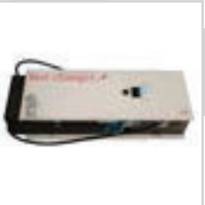
Efacedc QC20 DCFC