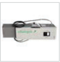
Efacedc Level II