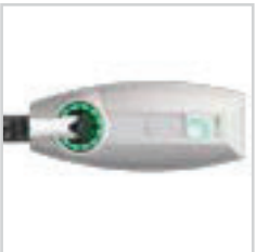
EV Box Pedestal