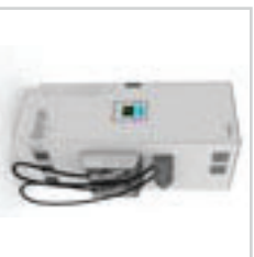
Efacedc QC50 DCFC