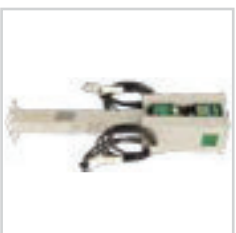
EVSE Inc. Standard