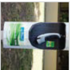
EVSE, Inc. Auto-Retract